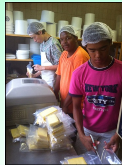
The Upper School children busy with their vocational skills training at Camphill Farm making cheese.