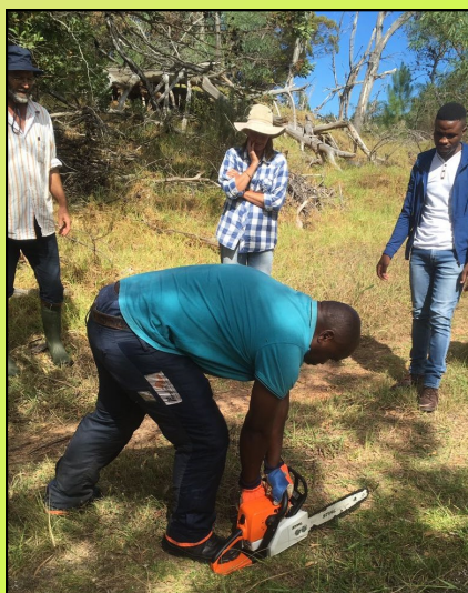
Chainsaw training in progress for the maintenance team