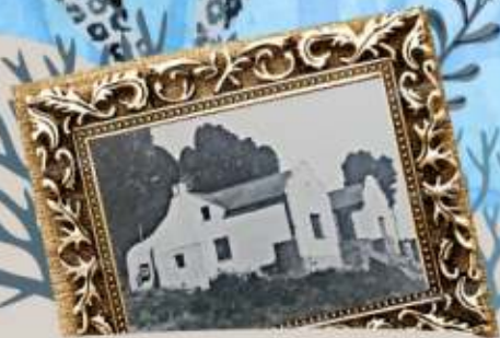
Camphill Dawn House 1952, Rudolf Steiner farm school