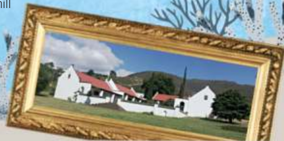
Camphill School currently 2015